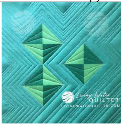
#108 – Power Lines