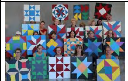
#106 – Barn Quilt Painted Block