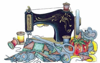
#109 – Come Quilt with Me