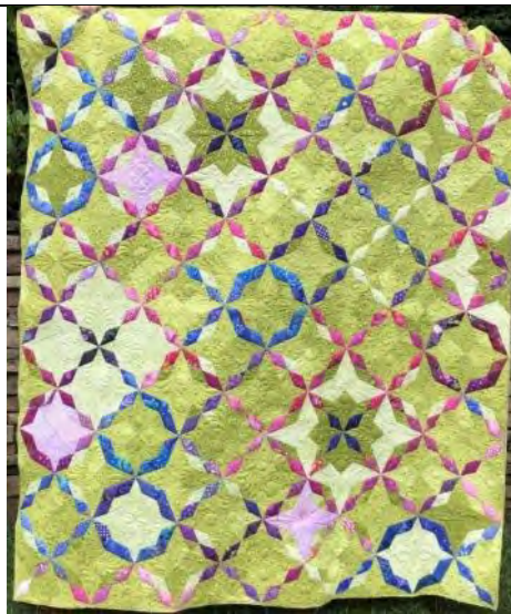
#105 – Therapy