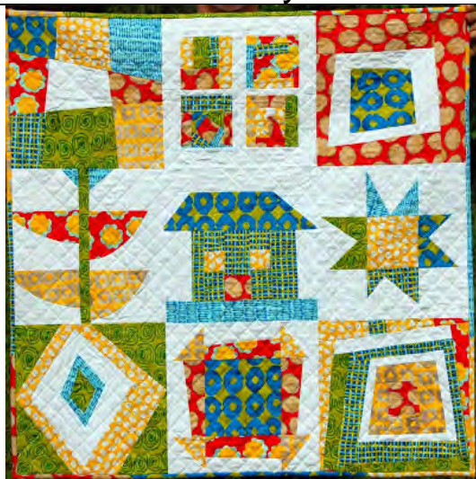
#104 – Modern Improv