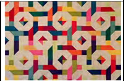
#103 – Over & Under Rainbow