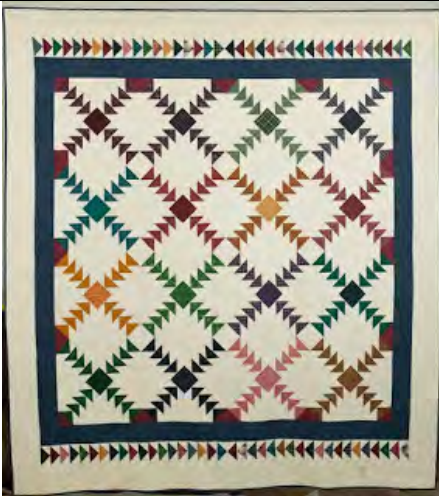
#101 – 5 Easy Pieces