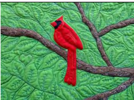
#107 – Machine Quilting 1 & 2