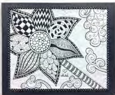
#207 – Zentangle