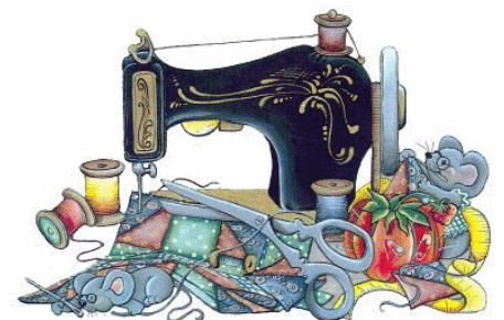
#209 – Come Quilt with Me