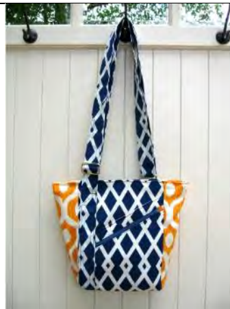
#108 – Stowaway