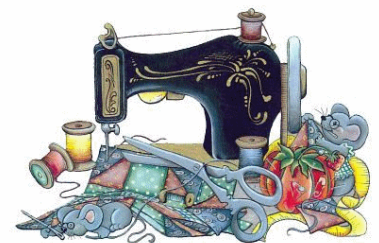
#109 – Come Quilt with Me