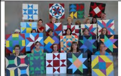
#106 – Barn Quilt Painted Block