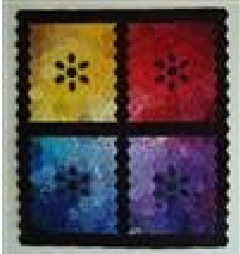
#207 – Hexie Daisy