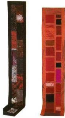
#202 – Print and Piece – a Table Runner to Remember