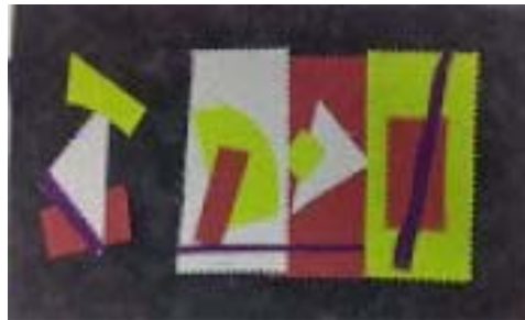
#205 – Fearless Color