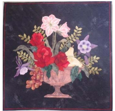
#206 – Appliquick: A Better Way to Applique