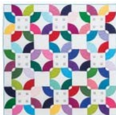
#208 – Double Wedding Rings