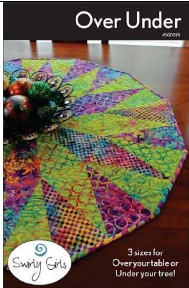
#204 – Over Under Table Topper