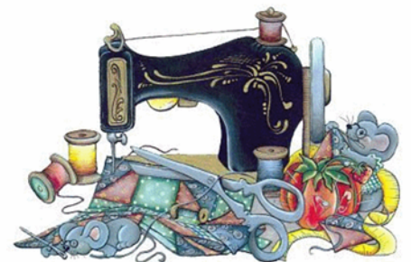
#209 – Come Quilt with Me