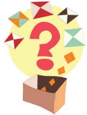
#203 – Ready, Set, Start Your Machines! Mystery